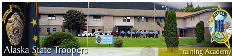
Alaska Public Safety Training Academy

Fire Department (Information/business) Phone: 747-3233 Fax: 747-7450 209 Lake Street, Sitka, Alaska Emergency 911 Police Department (Information/Business) Phone: 747-3245 Fax: 747-1075 304 Lake Street, Sitka, Alaska Emergency 911 Sitka Community Hospital Phone: 747-3241 209 Moller Drive, Sitka, Alaska South East Alaska Regional Health Consortium (SEARHC) 222 Tongass Drive, Sitka, Alaska Phone 966-2411 United States Coast Guard (Emergency) Phone: 966-2411 or 1-800-478-5555 Crisis Line Agency (24 hour line) Phone: 747-6511 or 1-800-478-6511 Poison Information Center Phone: 1-800-478-3193