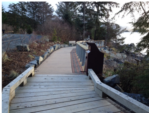
The Sea Walk from downtown to Totem Park